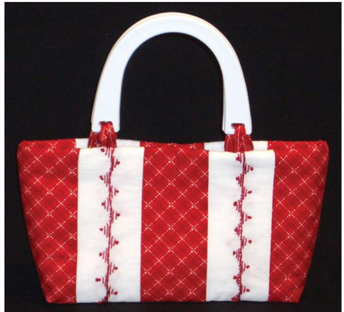
CHLOE HANDBAG #120

Handle Note: The handle shown on our vintage redwork Chloe was created using a pair of black 'U' shaped handles from Clover, item #G324. We spray painted the handles using a paint specifically made to stick to plastic. We strung a piece of monofilament thread (because it's so thin) through the handle ends and tied the ends together. We taped some newspaper to the wall in our garage and covered the floor in that area too. Then we held the thread in one hand, which meant the handle was upside down, gave the handle a gently push on one side to get it twirling, then grabbed the paint and carefully and lightly sprayed the handle. We twirled the handle the other way and sprayed again. Follow the paint instructions and spray until you are content. Because it was upside down, we had trouble painting the very top ridge of the handle. We touched it up later with a cotton swab.