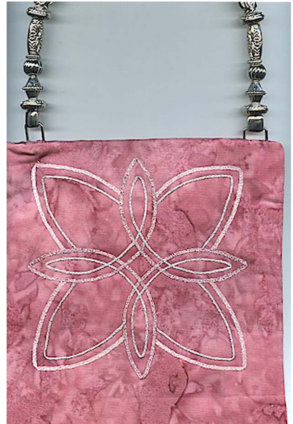
QUILT DESIGN AS EMBELLISHMENT ON KATY BAGS #121